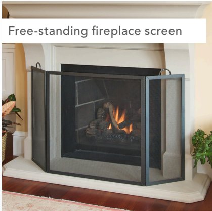
Free-standing fireplace screen

The glass fronts and surrounding surfaces can become extremely hot during and even long after operation. Touching the hot glass front can lead to serious burns.